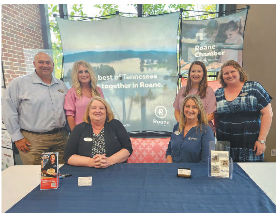
The Roane County Chamber of Commerce gathers for a quick photo at the Regional Networking at The Venue Lenoir City.