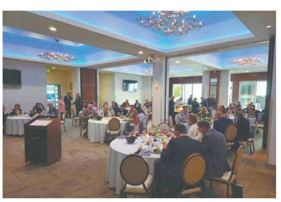
Chamber Enterprise Members, Ambassadors, and Board Members, as well as the VIP Committee and Committee Chairs and event sponsors, His Security & Technology, The Knox Fox Real Estate Group, Movement Mortgage, and Burns Mailing and Printing, enjoy networking before the program begins.