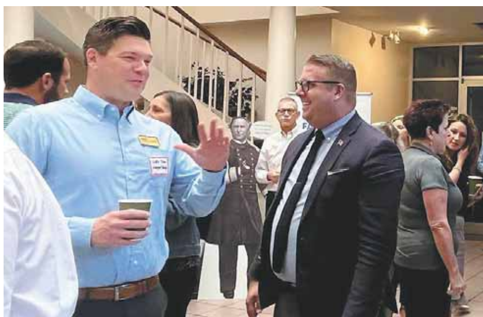
Many people, chamber members, and community members alike, gather in Farragut Town Hall for the Tennessee Strategies networking.