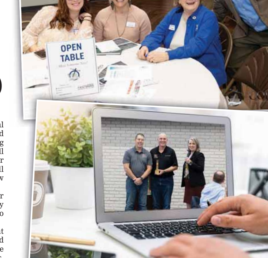
2020 Orientation photos by Colby's Photo & Video

Single level sponsorships are available which include promotion at BOTH events and is industry-exclusive. Contact Julie Blaylock at 865-675-7057 or email julie@farragutchamber.com for information and to confirm in order to begin