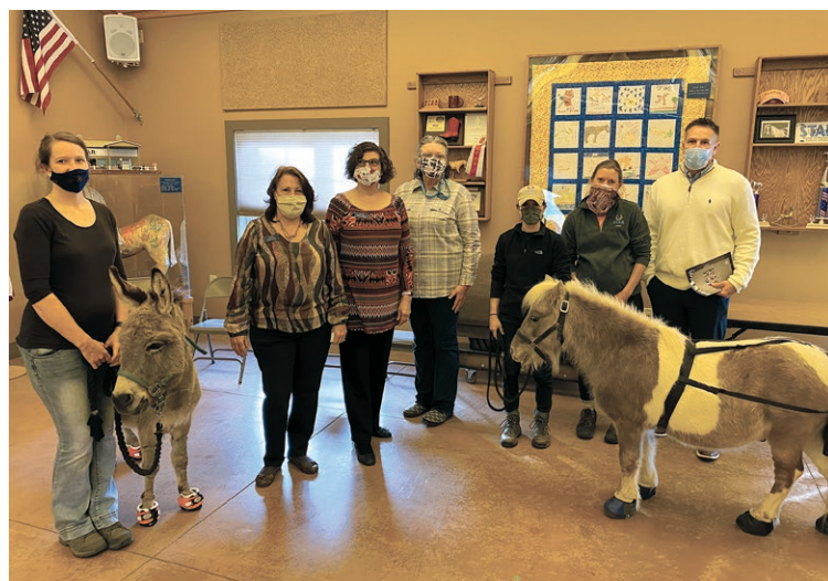
Double Hosted Networking with STAR and Epic Nine November 5, 2020