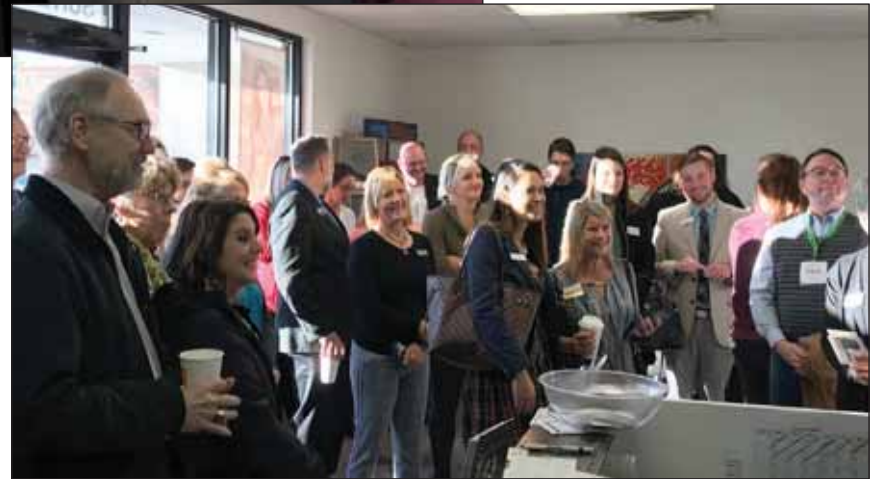
Right: The Chamber's first networking event of the year was very successful. Attendees enjoyed good food and conversation along with outstanding hospitality.