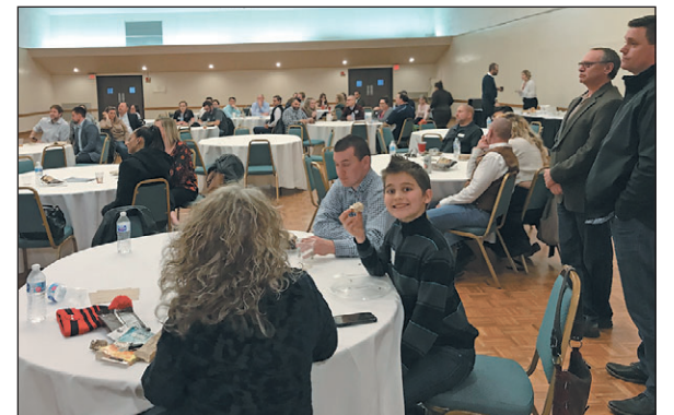
The family-friendly networking event was a huge success for Chamber members, guests and even their children: many of whom stayed afterwards for Farragut West Knox Chamber group night to watch an exciting, action-packed evening of hockey.