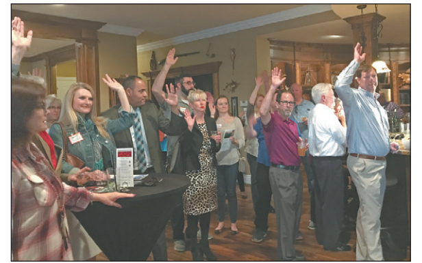
Attendees, which included not only WindRiver residents but also Chamber members and guests alike, raised their hands high while participating in an exciting and informative evening that will not-soon be forgotten!