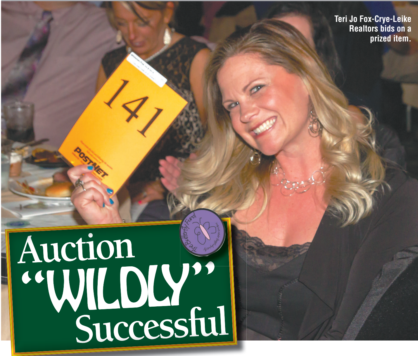
Teri Jo Fox-Crye-Leike Realtors bids on a prized item.