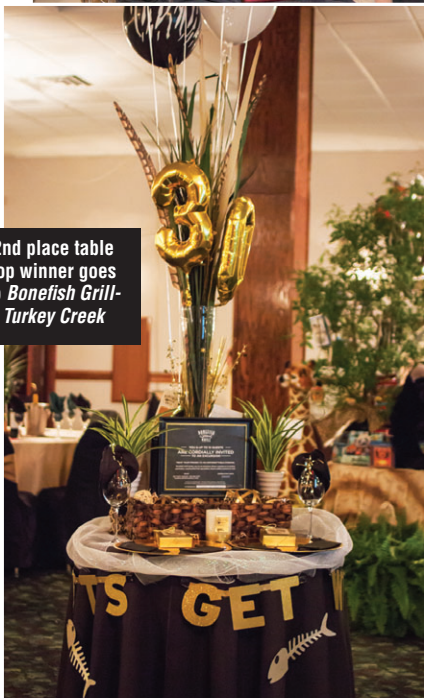
2nd place table top winner goes to Bonefish Grill-Turkey Creek