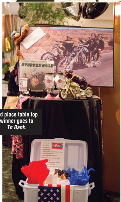
3rd place table top winner goes to Tn Bank.