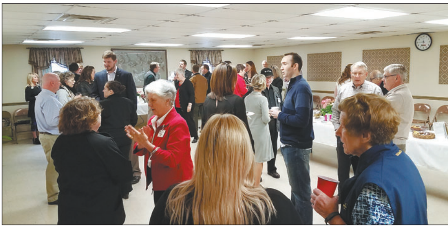
Nothing draws networking guests like the promise of a homemade breakfast buffet!