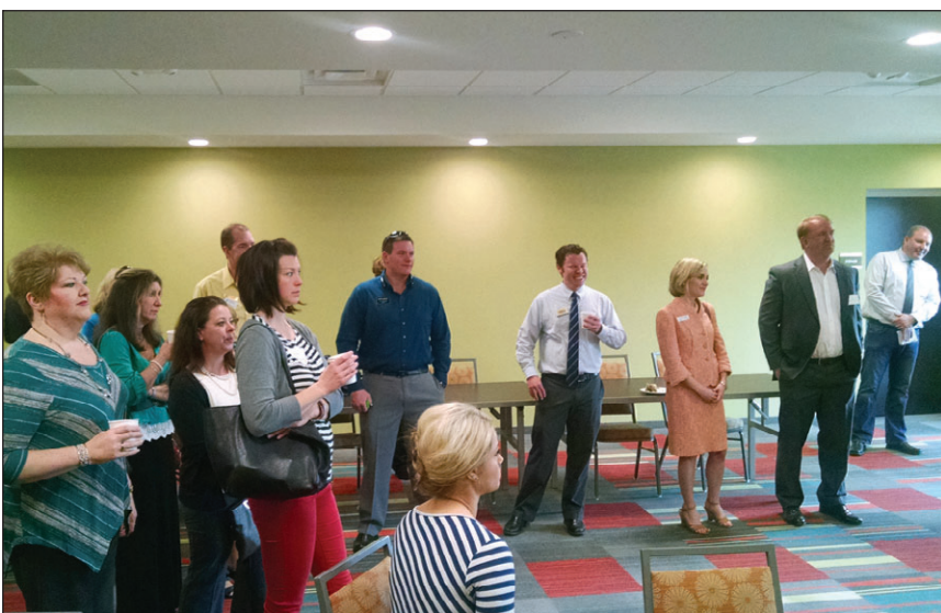
Networking host Home2Suites had a meeting room full of Chamber members and guests! Here the crowd gathers for the weekly announcements.