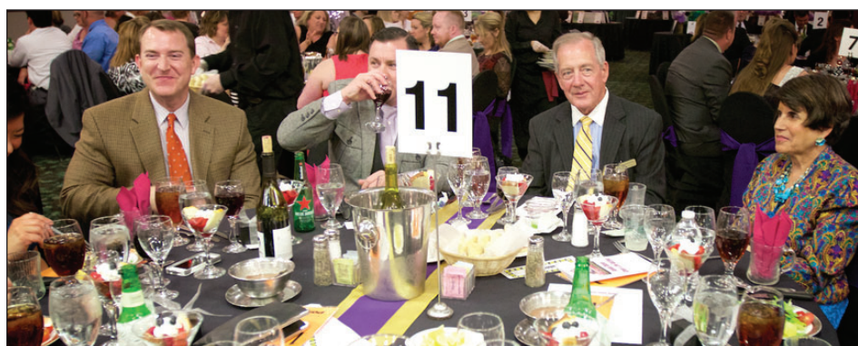
Event Sponsor Town of Farragut enjoys the 2015 auction.

In 28 years the Chamber has Put on the Ritz, Entertained and Turned Dreams to Reality. It has celebrated Mardi Gras, the Kentucky Derby and so much more! For 2016 the Chamber is on the road: The Road to Rio, that is!