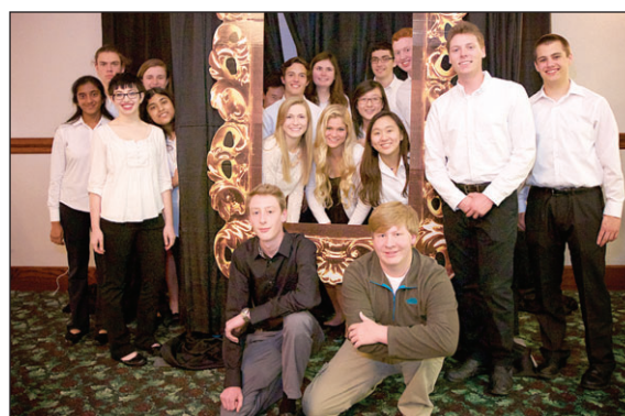
Right: Student volunteers are an essential asset to the event.