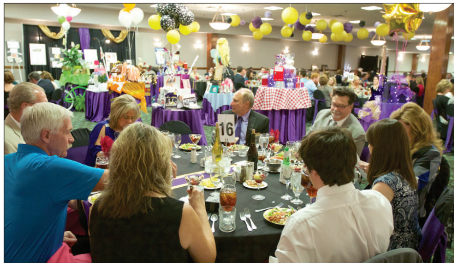
Above: 2016 tabletop sponsors will be featured front and center in the ballroom as in 2015.