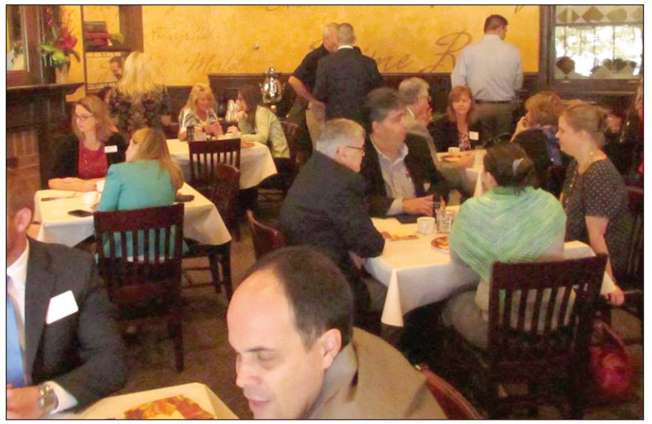
Dozens of networking guests appreciate the warm dining area by a crackling fire at The Chop House during the morning networking.