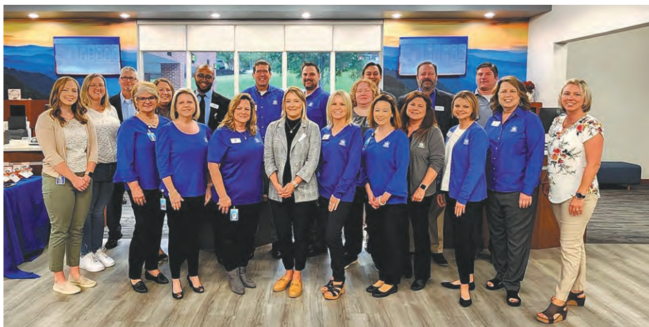
The Y-12 FCU Middlebrook Pike Team poses for a group photo along with many colleagues from other local Y-12 branches and departments during their fun morning networking.