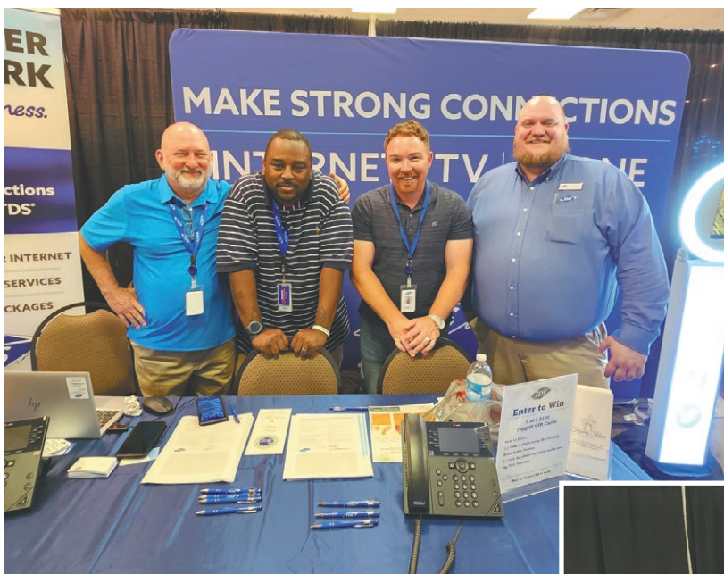
Presenting Sponsor TDS Telecom members smile for a group photo at the EXPO.