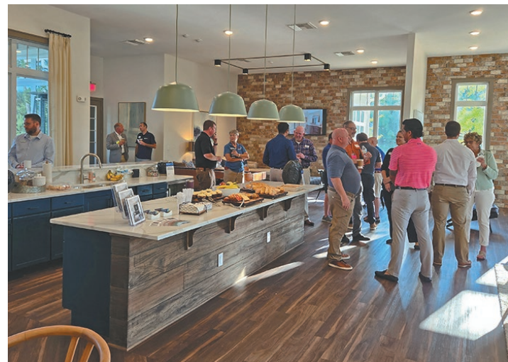
Business Professionals make connections and enjoy refreshments.