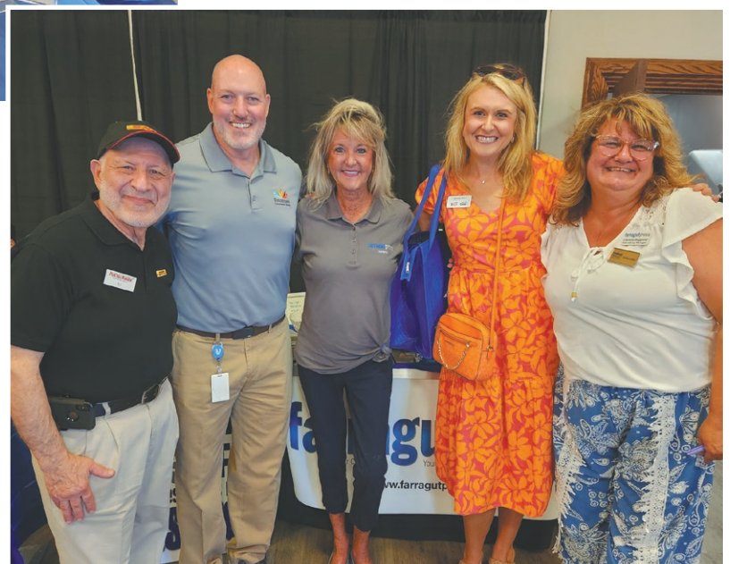
Members from the farragutpress gather for a group photo with other EXPO attendees.