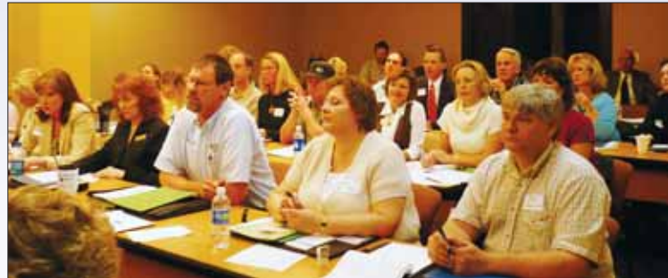
Members of the Farragut West Knox Chamber of Commerce gather at SunTrust Financial Center for Grassroots Marketing Seminar.

The Chamber would like to thank SunTrust Financial Center for providing the meeting room for this seminar. For more information about the TSBD, call the Chamber office at 675-7057.