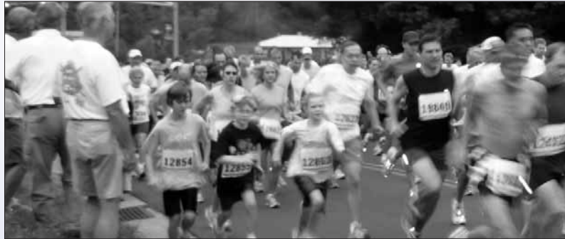
With the smoke from the starting gun billowing in the background, runners make their way up Watt Road at the Farragut Fall 5K, Fun Run & Pet Parade.