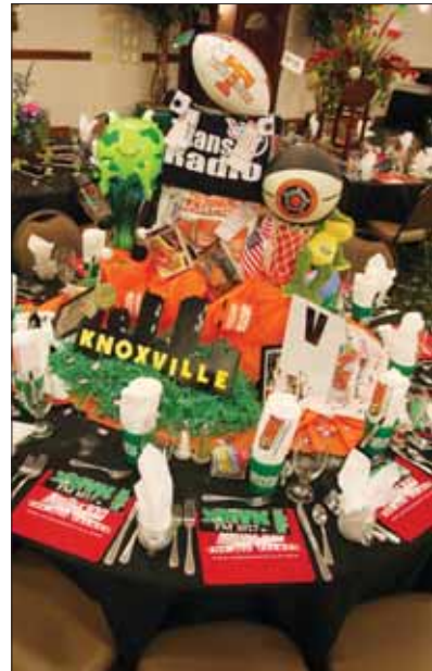
One of the award-winning tables was sponsored by Citadel Broadcasting. The table-top, which was auctioned during the live auction section of the dinner, included items such as autographed CDs, Dollywood tickets and University of Tennessee paraphernalia.