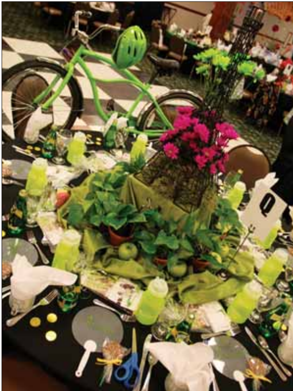
Regions Bank also sponsored a table for the auction and followed in a Tour de France theme, including a bicycle, in their traditional lime green color scheme. (Above photo)