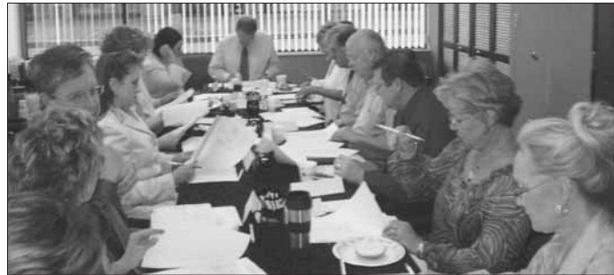
Board of Directors meeting, August 2007.

Farragut West Knox Chamber of Commerce is now accepting applications for positions for the Board of Directors for the 2008-09 fiscal year.