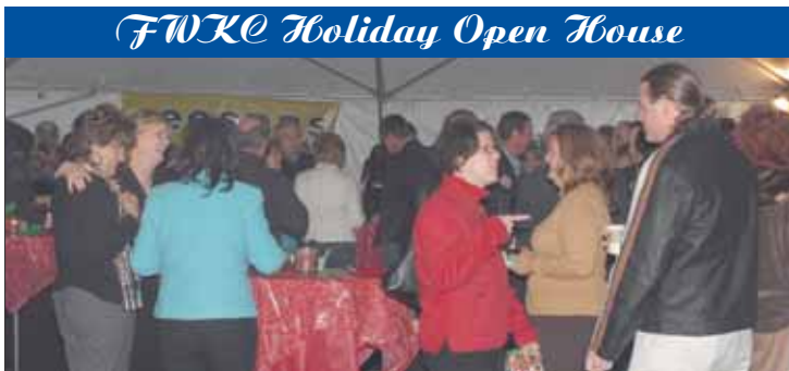
Farragut West Knox Chamber members and guests filled the party tent and enjoyed the Holiday Open House.