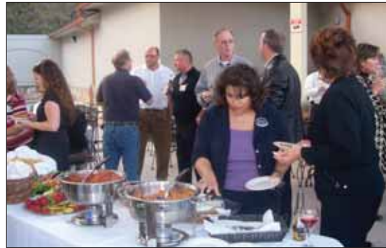
Members of the Farragut West Knox Chamber of Commerce gather on the patio of Mulligan's for an after-hours networking hosted by Nicely Business Services Thursday, November 1.