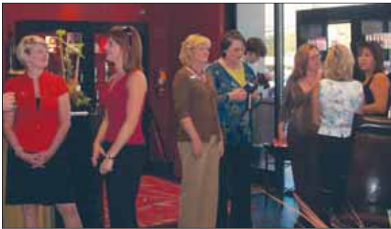
Farragut West Knox Chamber members who gathered for the ribbon cutting ceremony at Salon Biyoshi Tuesday, September 19, took tours through the salon and enjoyed some breakfast treats.