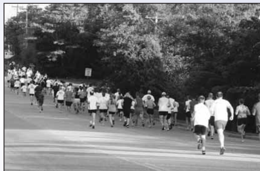
The Farragut Fall 5K runners make the initial trek up Watt Road before entering Sedgfield subdivision at the race Saturday, September 22.