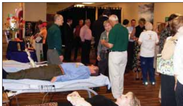
Above Left: On March 29, a first of its kind networking was held by five FWKCOC members! Migun of TN, West Bicycles, Concord Health Initiatives, Antiquities and EarthFare teamed together for a fabulous gathering. As you can see from this photo, several members enjoyed a trial run of the Migun beds. Members also sampled the healthful Mangosteen juice, viewed the gorgeous bikes at West Bicycle, enjoyed a variety of foods and beverages provided by EarthFare and received some beautiful door prizes provided by Antiquities.