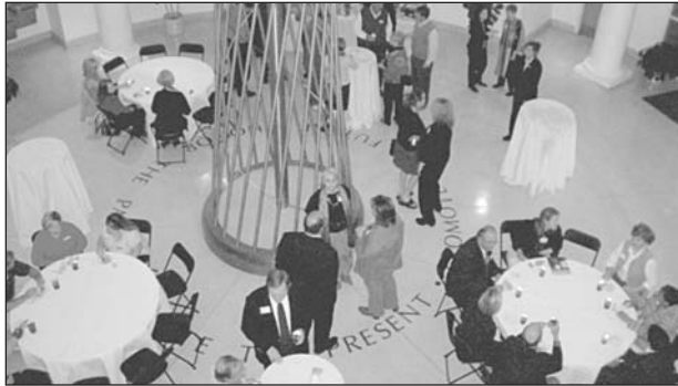
Above: November 9th the Women's Basketball Hall of Fame and Knoxville Tourism and Sports Corp. held an evening networking. A tour of the hall and a video presentation about women's basketball history helped to make the night. Chamber members gathered for food, fun and networking.